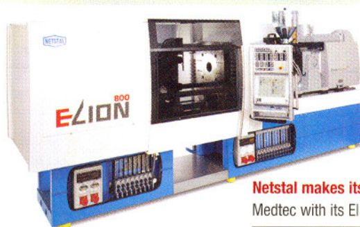
Netstal makes its debut at Medtec with its Elion 800 press.

Netstal, Näfels, Switzerland; +41 55-618-6111; www.netstal.com