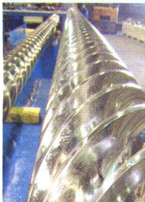
Turbo-Screws are ready for foaming...

Plastic Engineering Associates Licensing Inc., Boca Raton, FL, U.S.A.; +1 561-998-4140; www.turboscrews.com